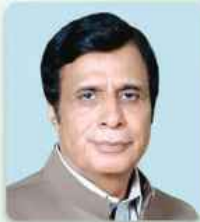
Chief Minister Punjab Chaudhry Pervaiz Elahi