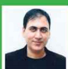
Dr. Abdul Rasheed Institute of Business Administration