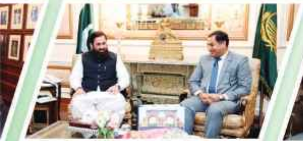
Meeting with Hounorable Governor