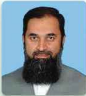
Governor Punjab Muhammad Baligh Ur Rehman