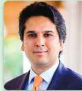
Former Provincial Minister Finance Makhdoom Hashim Jawan