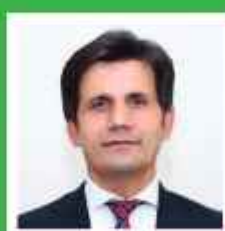
Dr. Jallat Khan Institute of Biological Sciences