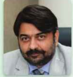
Provincial Minister Higher Education Raja Yassir Humayun Sarfraz