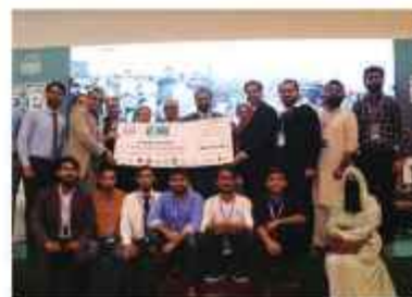
1st Position at All Punjab Universities Innovation Expo 2022