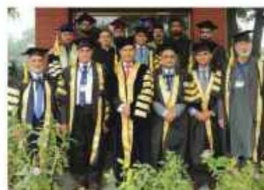
2nd Convocation of KFUEIT