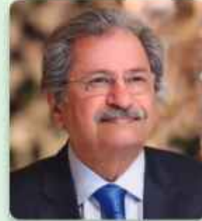
Former Federal Minister Education and Professional Training Shafqat Mahmood