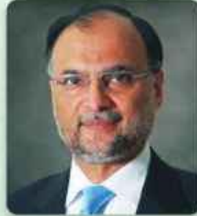
Federal Minister Planning and Development Ahsan Iqbal