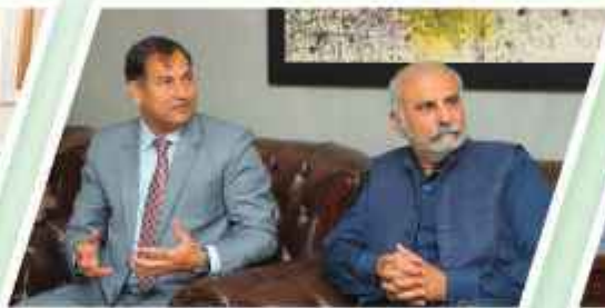
With Provincial Minister for Agriculture