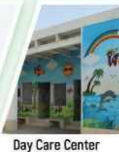
Day Care Center