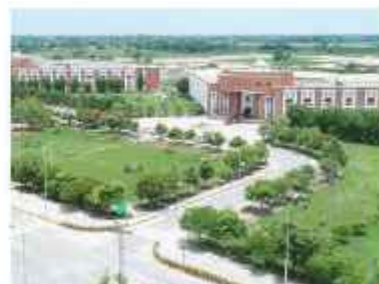
Clean & Green Campus