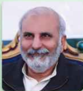
Provincial Minister Agriculture Hussain Jahania Gardezi