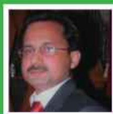
Dr. Ghulam Mustafa Kamal Institute of Health Science