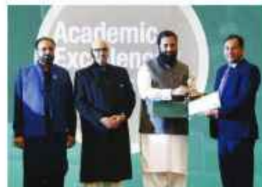
Academic Excellence Award